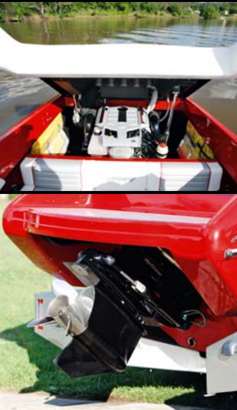
Above: The V8 MerCruiser's top speed was an impressive 64.3kts; Middle: Tight high-speed turns were no problem even at WOT; Below: Her 300lt tank is more than adequate for a full day of cruising.

multi-directional fibreglass and Vinylster resins. They're also the only Australian boats built with a vacuumed bagged hull and deck.