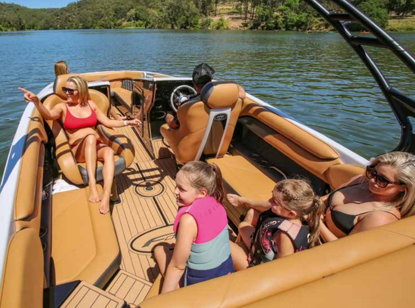
Above: Plenty of room to relax or move about in the spacious cockpit.