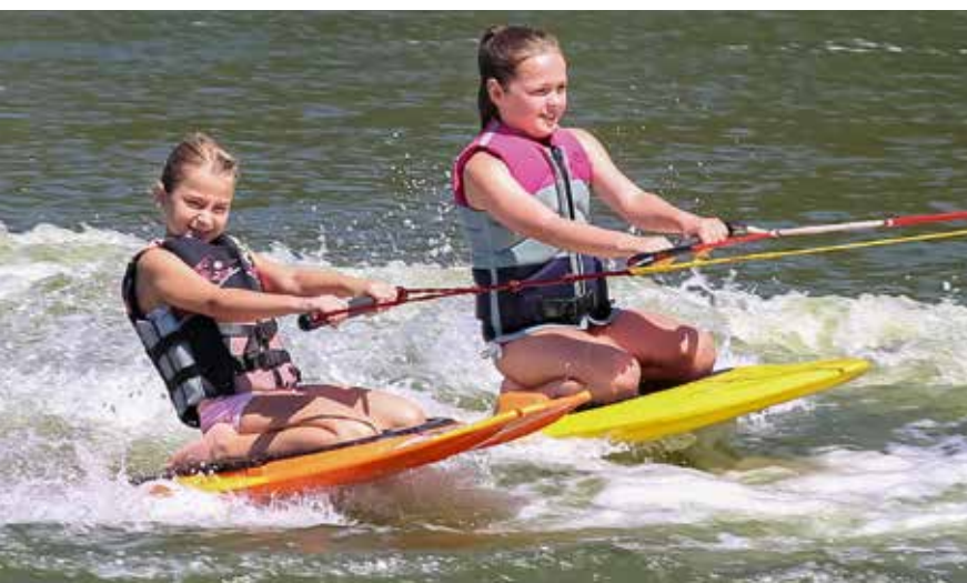
Below: Up, up and away!

compartments at the bow and located throughout the cockpit, with a large ski locker at the stern and a bin under the internal stairs that lead from the deep cockpit to the swimplatforms.